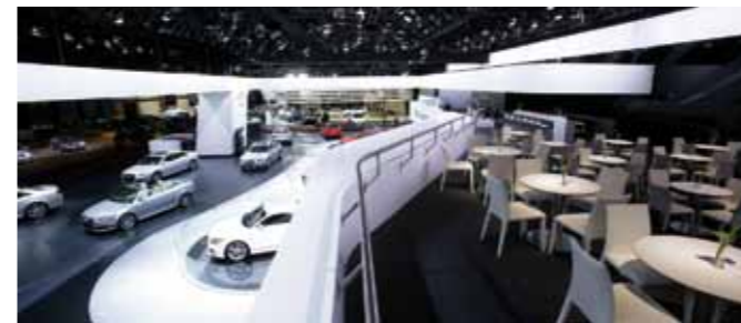
Audi exhibition stand, NAIAS 2009, Detroit (US)