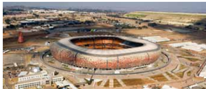
Soccer City, FIFA Football World Championship 2010, Johannesburg (ZA)