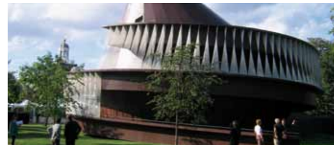
Serpentine Gallery Pavilion 2007, London (UK)