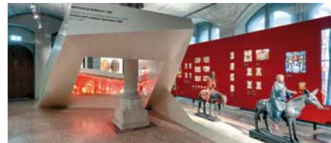
Exhibition "History of Switzerland", Swiss National Museum, Zurich (CH)