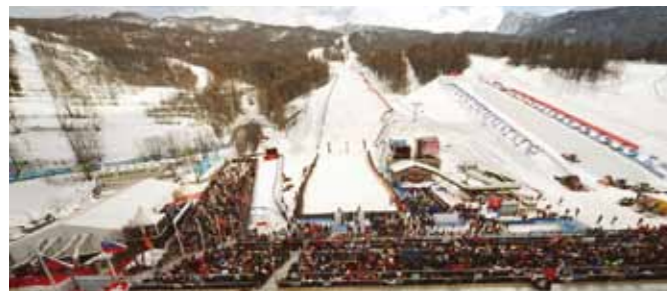
Olympic Winter Games 2006, Turin (IT)