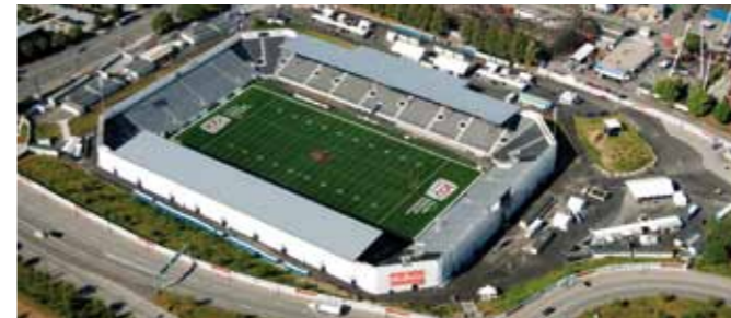
Empire Field Stadium 2010, Vancouver (CA)

The planning and installation of grandstands and stages is among our core competences. The modularity and versatility of our grandstand and stage systems allows for optimized application flexibility. Our proprietary systems are the result of decades of experience and solution competence, gained in practical event structure provision.