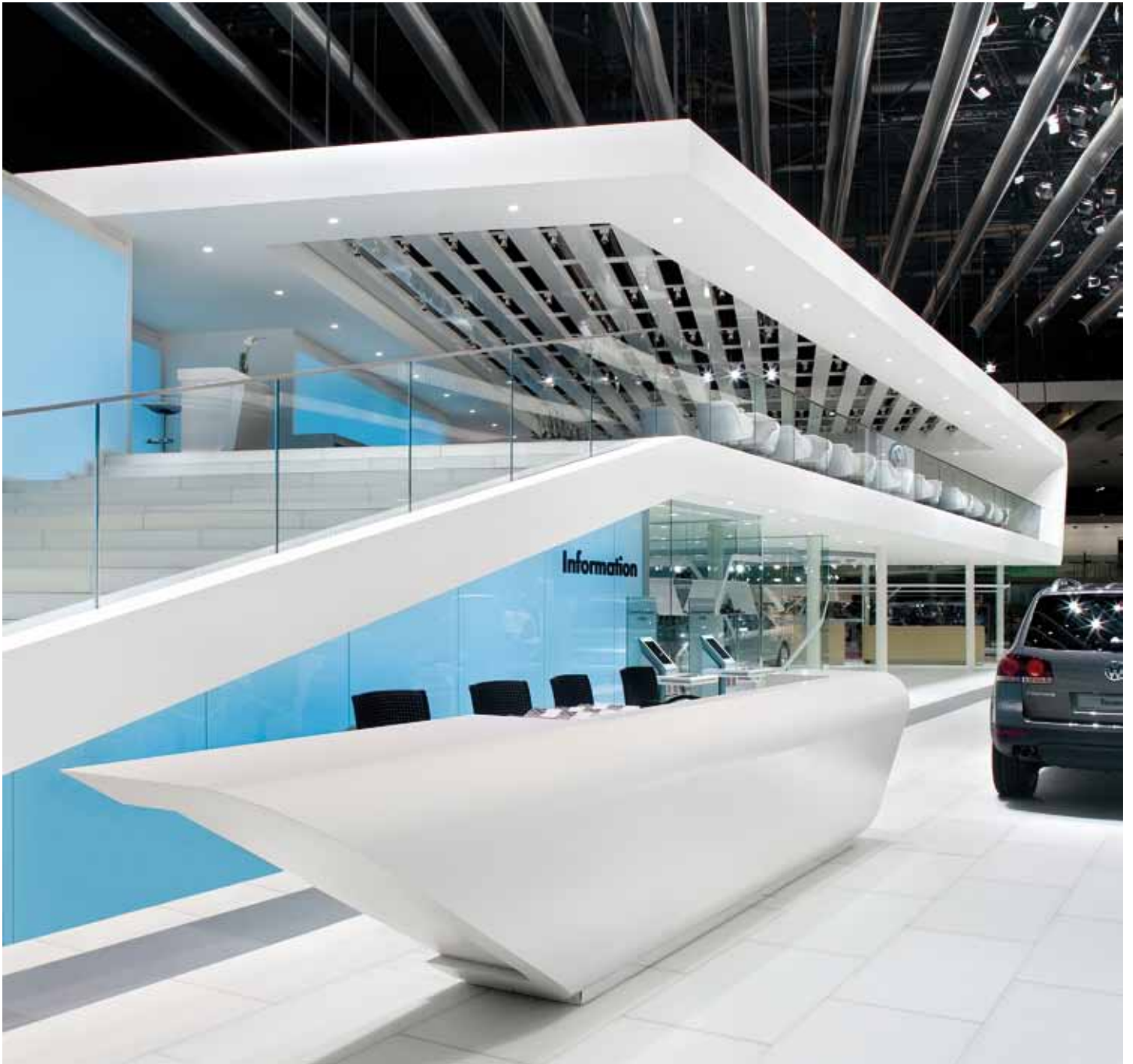
Exhibits, Pavilions, Exhibition Stands