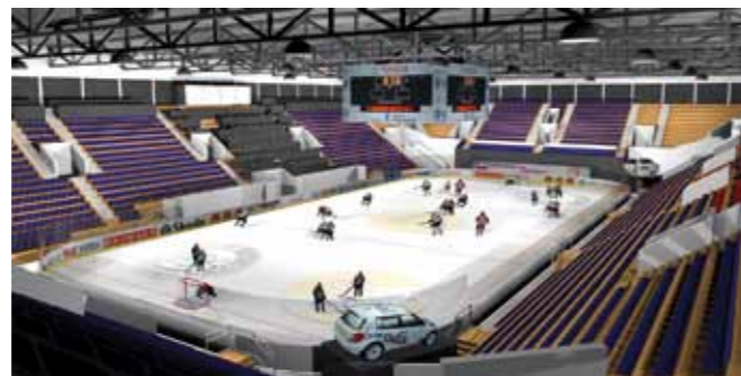
Left: Rendering, Modular stadium, FIFA Football World Championship 2022, Doha (QA); Rendering, IIHF Ice Hockey World Championship 2009, Zurich-Kloten (CH) Right: Rendering, Venice Olympic bid, Winter Olympics 2020, Venice (IT)