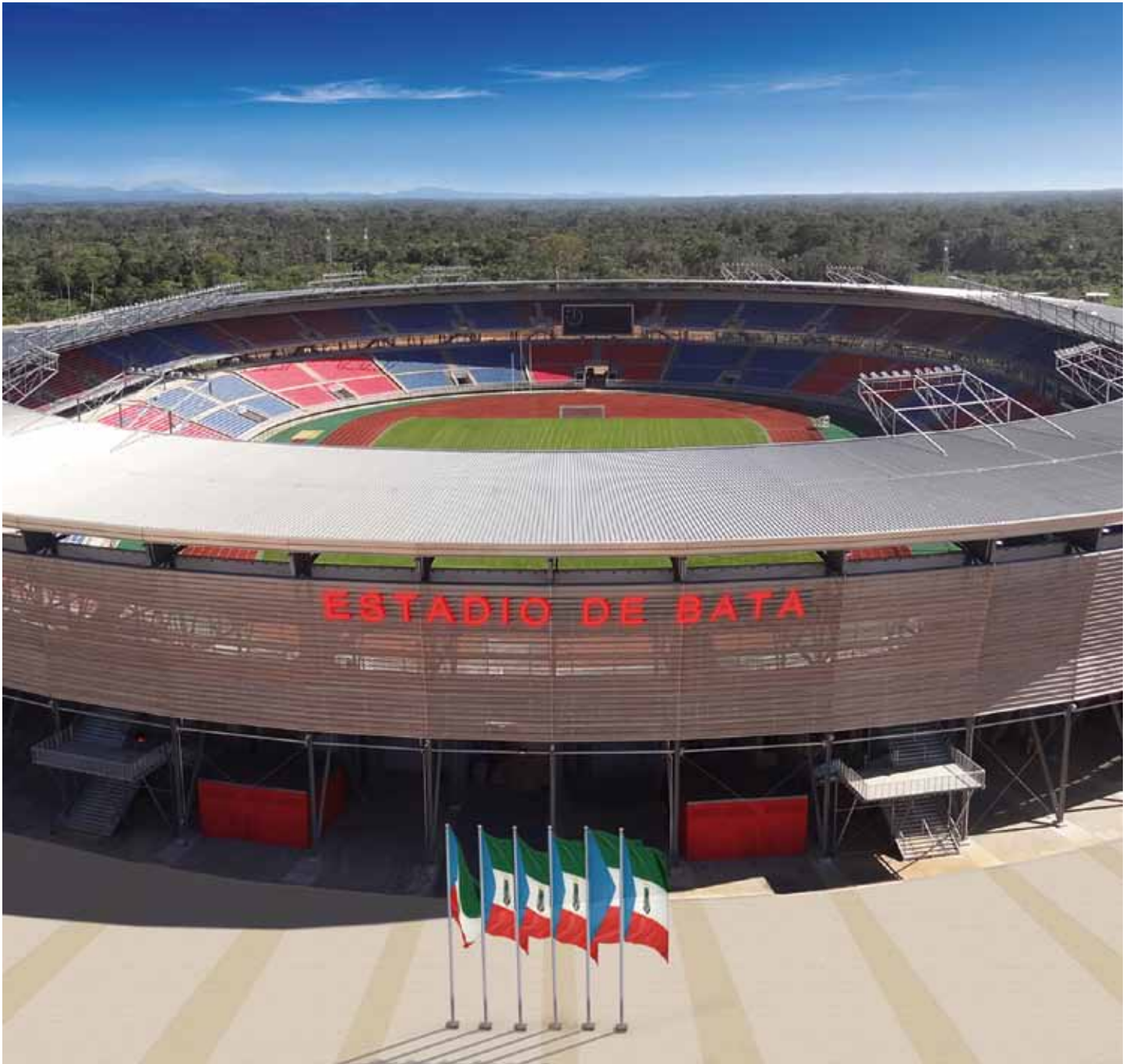
Modular Stadium ® , Stadium Extension